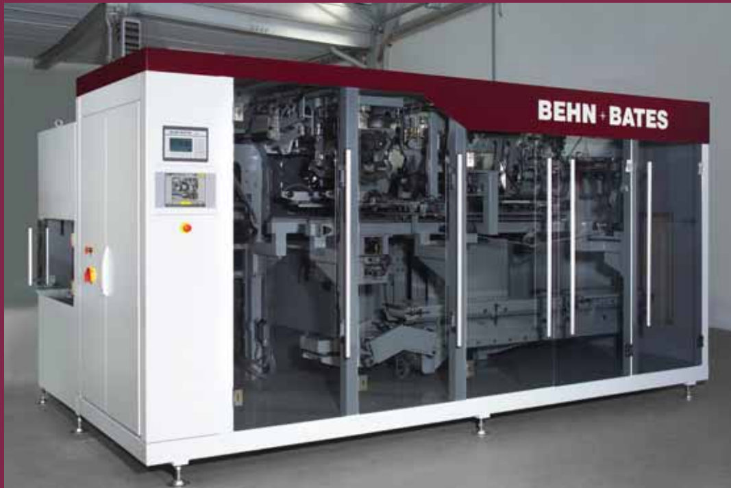
BEHN + BATES TOPLINE – The fully automatic system for filling powdery products into open-mouth bags with filling weights from 10 up to 25 kg at rates of 200 up to 600 bags per hour.

BEHN + BATES – Your reliable partner when it comes to fill food products in a clean and efficient way.