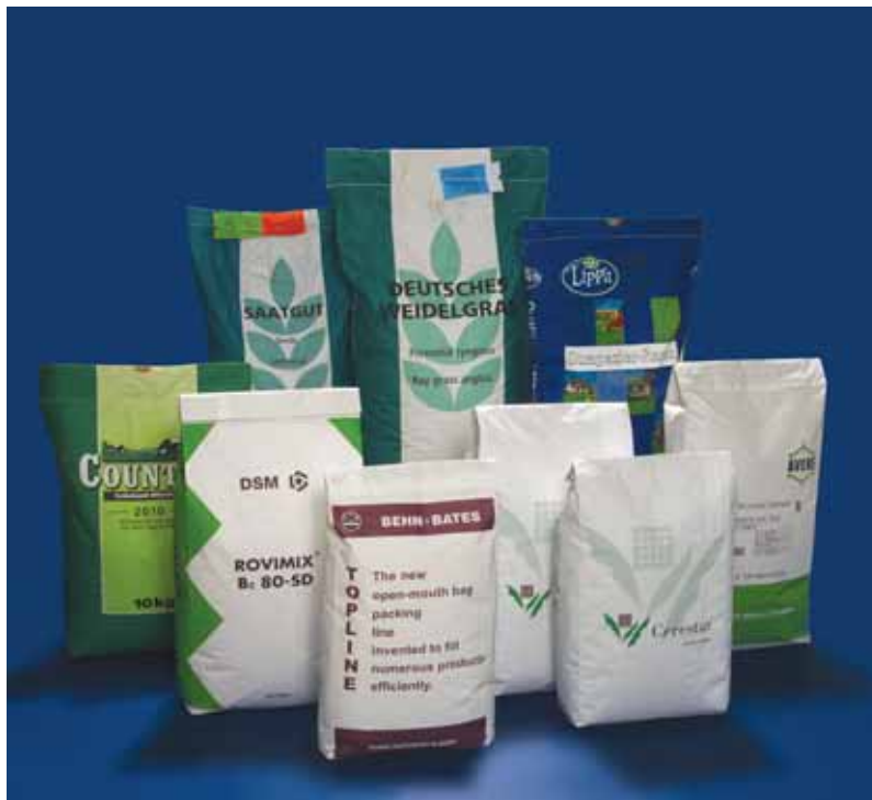
Bags that can be filled by the ORBIS