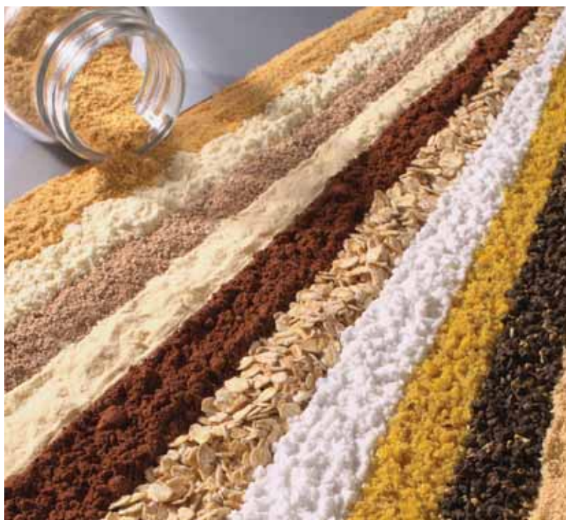
Products that can be filled by the ORBIS